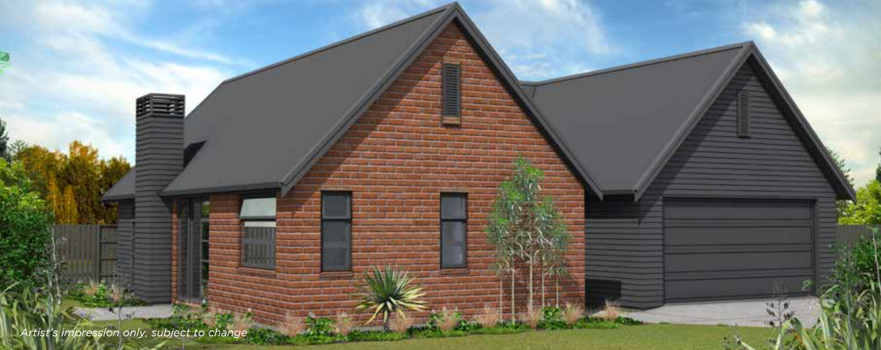
Artist's impression only, subject to change